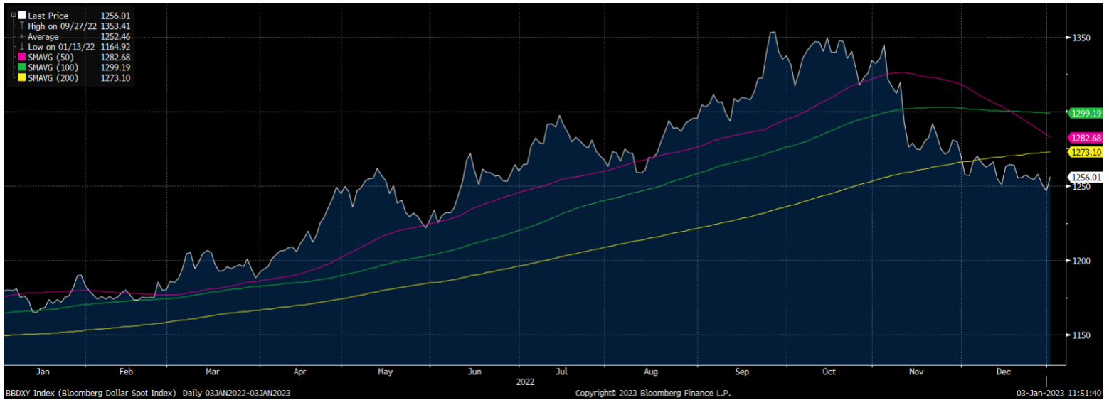
1-Year U.S. Dollar Spot Rate (Bloomberg Dollar Spot Index).

The U.S. dollar remains the most important chart for the markets as we enter 2023.