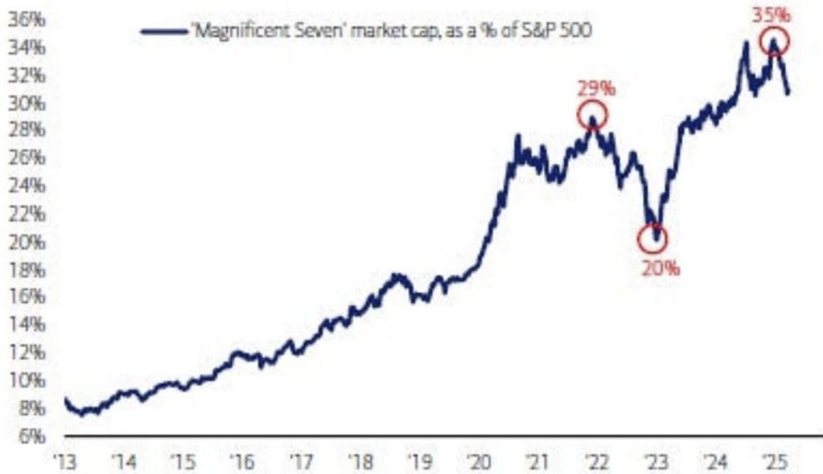
Chart 13: "Magnificent 7" to "Lagnificent 7" Magnificent 7 market cap as % of S&P500